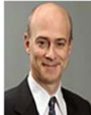
Nippon Life Professor of Finance and Professor of Economics Wharton School of the University of Pennsylvania